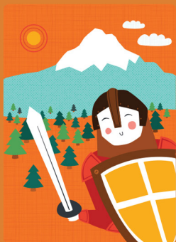
Resguard dels Vents