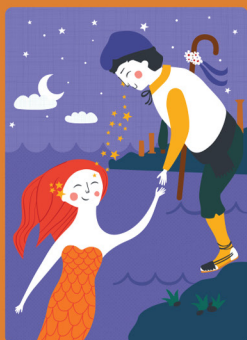
Hostal Spa Empúries