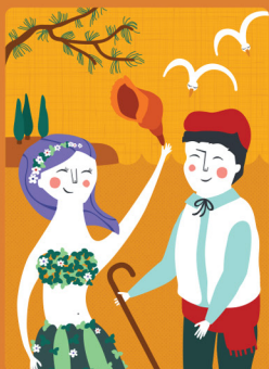
Premier Gran Hotel Reyman