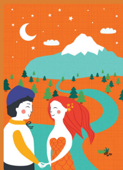
Hotel & Spa Terraza