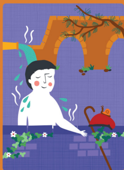
Hotel-Balneari Vichy Catalan